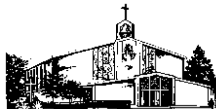
The Mother Church of the Ronkonkomas